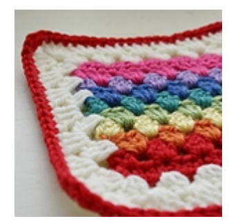
Granny Stripe Square