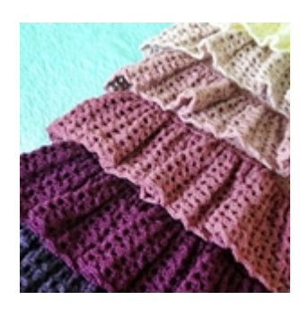
Ombre Ruffle Blanket