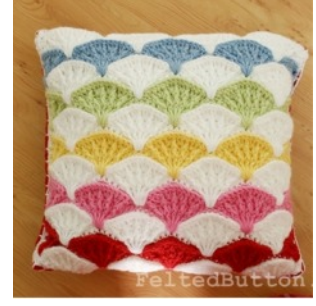
Paintbrush Pillow & Afghan