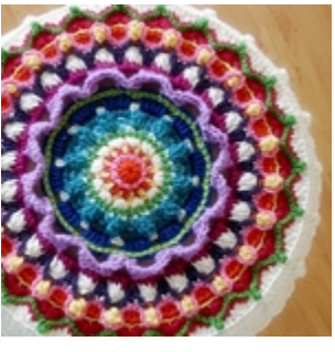
Mandala & Stool Cover