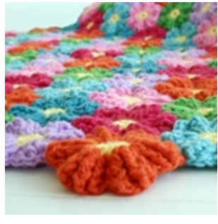
Waikiki Wildflower Blanket